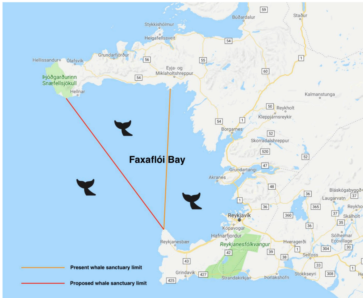
Fig. 2. Current limit and proposed expansion of the Faxaflói Bay Whale Sanctuary (Google Maps, 2018, edited by authors).

Hanemann (2005), Dillman (2011) and Johnston et al. (2017). It consisted of three sections: (i) attitudinal questions on environmental issues and economic activities related to whales in Iceland; (ii) brief description of the whale sanctuary, questions on participants' familiarity with the case study site and a bidding process to elicit WTP; and (iii) a set of socio-demographic questions.